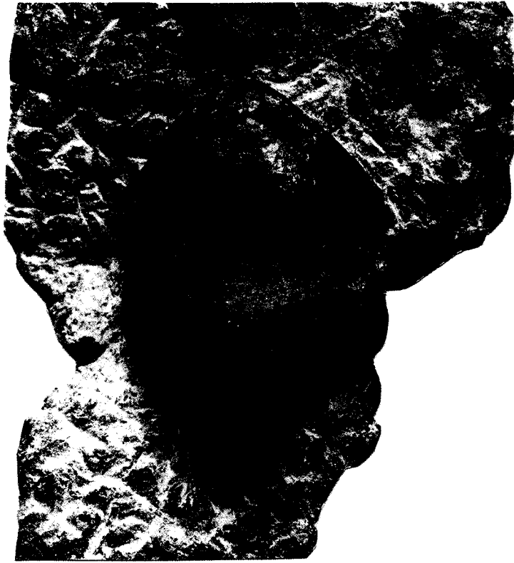
Fig. 2. Petalodont of uncertain identity; labial aspect. Upper Carboniferous, a large block lying in a small brook southeast of the village of Planina pod Golico. Personal property: Milan Peternel, Jesenice. Total length: 35.8 mm

Sl. 2. Petalodont še nejasne sistematske uvrstitve; labialna stran. Zgornji karbon, velik apnenčev blok v potoku južnovzhodno od Planine pod Golico. Last: Milan Peternel, Jesenice. Celotna dolžina zoba je 35.8 mm