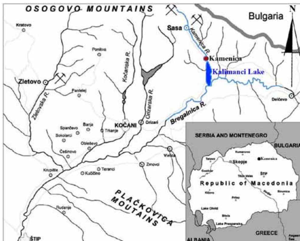
Fig. 1. Map of the study area. Sasa mine and its tailings dams are connected with Lake Kalimanci with Kamenica River.

Sl. 1. Karta obravnavanega območja. Rudnik in jalovišče Sase sta povezana s Kameniškim jezerom preko reke Kamenice.